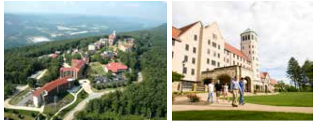
AERIAL VIEW / CARTER HALL